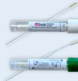
White Copan Eswab (Preferred)