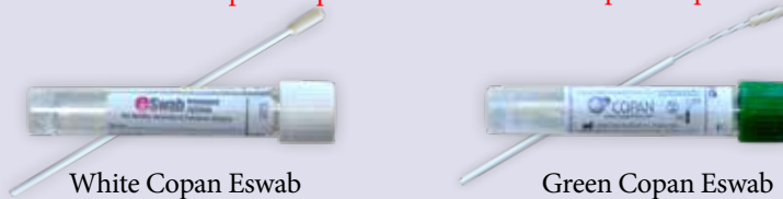
White Copan Eswab